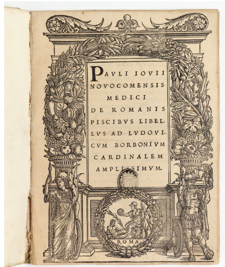
Height of binding 272 mm