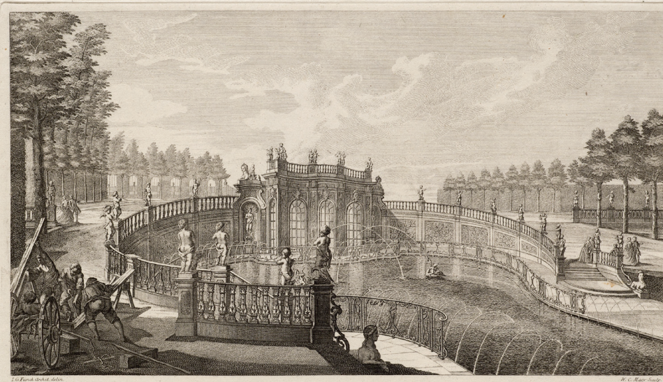
Die Grotte zu Wilhelmsthal.